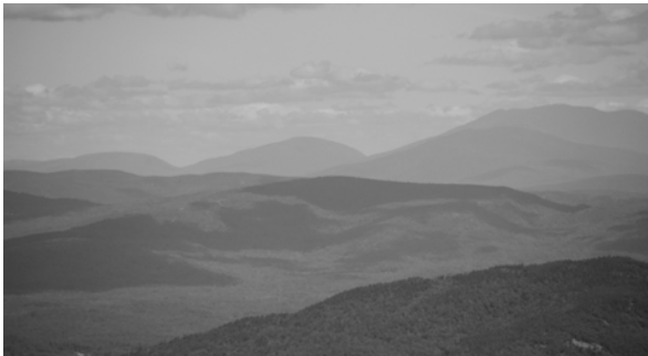
View from Mt. Kearsarge, Wilmot