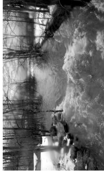
Kimpton Brook after heavy rain. Wilmot Center