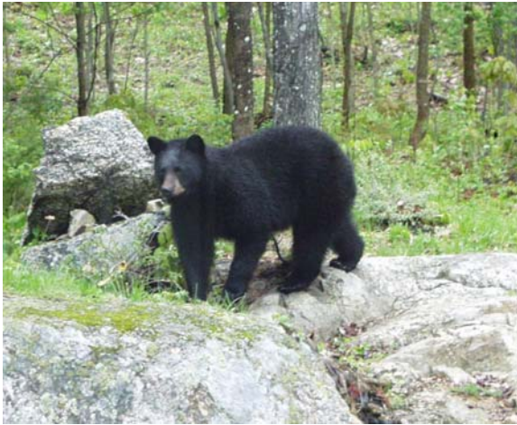
A furry resident of Wilmot enjoys the woodlands

In March of 2004, in acknowledgement of Wilmot's rapid growth and the town's desire to maintain its rural character, the Town of Wilmot voted to establish the Conservation Commission under the provisions of the State's RSA 36-A "for the proper utilization and protection of the natural resources" of Wilmot. The volunteers on the Conservation Commission are committed to giving thoughtful attention to both short-term and long-term conservations goals as the town grows and develops.